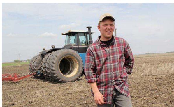
One of the most important actors when it comes to biodiversity conservation and the provision of ecosystem services in agricultural landscapes: a farmer.