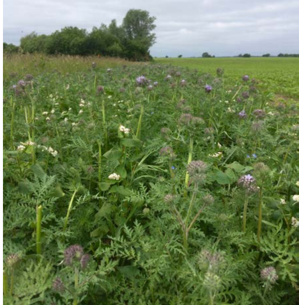
Sown flower strips can benefit pollinators in agricultural landscapes, but their effectiveness could be increased by coordinating implementation over larger scales than single farms.

Generally, participants favoured scenarios with a higher degree of collaboration and coordination among actors as well as more local decisions and active participation in decision-making. However, participants also considered the difficulties related to collaboration (e.g. if actors are unmotivated or solely pursue their own interests).